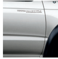
Lunar Mist Metallic 6 with Charcoal interior