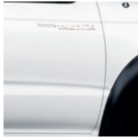
Super White 1,2,3 with Charcoal or Oak interior