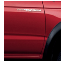
Impulse Red Pearl 1 with Charcoal or Oak interior