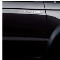
Black Sand Pear with Charcoal or Oak interior