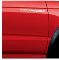
Radiant Red 4 with Charcoal or Oak interior