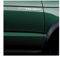
Imperial Jade Mica 4,5,6 with Charcoal or Oak interior