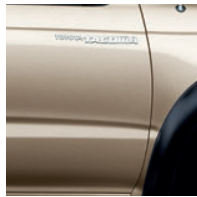
Mystic Gold Metallic 1,2,3 with Charcoal or Oak interior