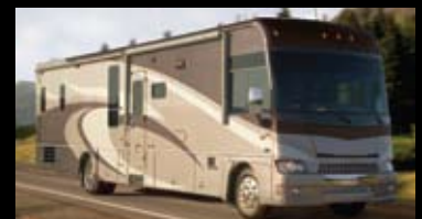
CLASS A MOTORHOMES