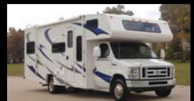
CLASS C MOTORHOMES