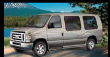
VAN CONVERSIONS/ CLASS B VAN CAMPERS